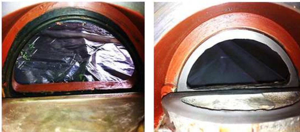
Figure 2: Wear Occurrence Place of Dual Plate Check Valve